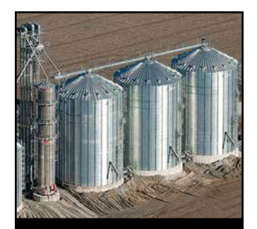
Brock's EVEREST® Grain Bins offer the tallest heights, with eave heights reaching up to 107 feet (32.6m) to provide nearly 14% higher grain holding capacities.

Bins are available in either a flat bottom or a hopper style.