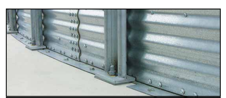
FULL SWEEP® Bin Anchor System allows for single-pass sweeping and eliminates the need for entry during the process. Reinforces the bottom-tier sidewall to anchor the bin and prevents moisture penetration.