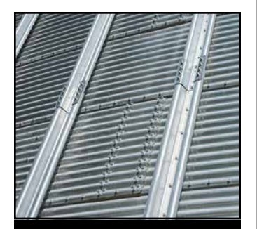
Sidewall Stiffeners are among the strongest available to help manage the stress and strain of weather, grain, cables and roof-mounted equipment.