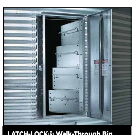
LATCH-LOCK® Walk-Through Bin Entry Doors feature a one-piece outer door and four interlocking panels that open with a lift of the latch.