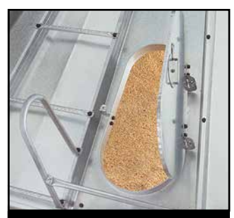
Large Roof Manhole has an "ob-round" shape and rotating latch for easy entry and exit.

Bins are available in either a flat bottom or a hopper style.