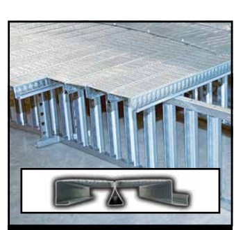
TRI-CORR® Bin Aeration Flooring System provides even air distribution for easy bin clean-out. Triangleshaped center leg and corrugations on the surface and legs offer superior load-bearing capacity.