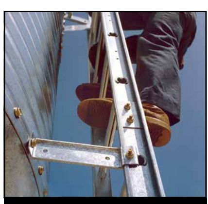
Sidewall Ladders have round rungs with a raised, non-skid surface and are permanently attached to the ladder rail for a hand-filling, secure grip.