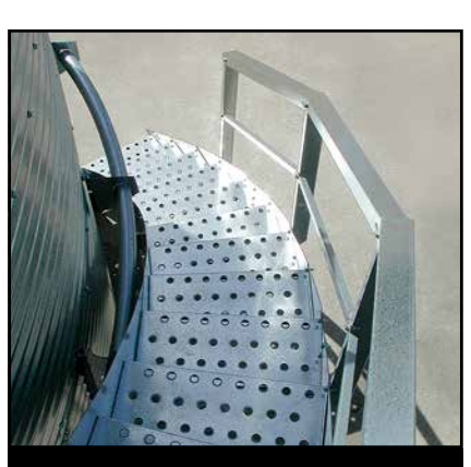
BROCK SHUR-STEP® Bin Stairs have a raised non-skid surface and can serve more than one bin. Install during construction or later.