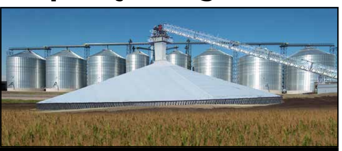
Brock's Temporary Storage Equipment offers a proven aeration system, precision design and unsurpassed quality to keep your ground piles performing well. Choose from the LeMar® Bunker System, Center Air System or Center Fill Towers.